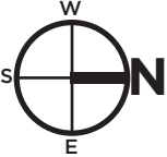
EAST FACING - PURVA

Modern Elegance Meets Tropical Serenity: Sleek Design, Lush Ambiance