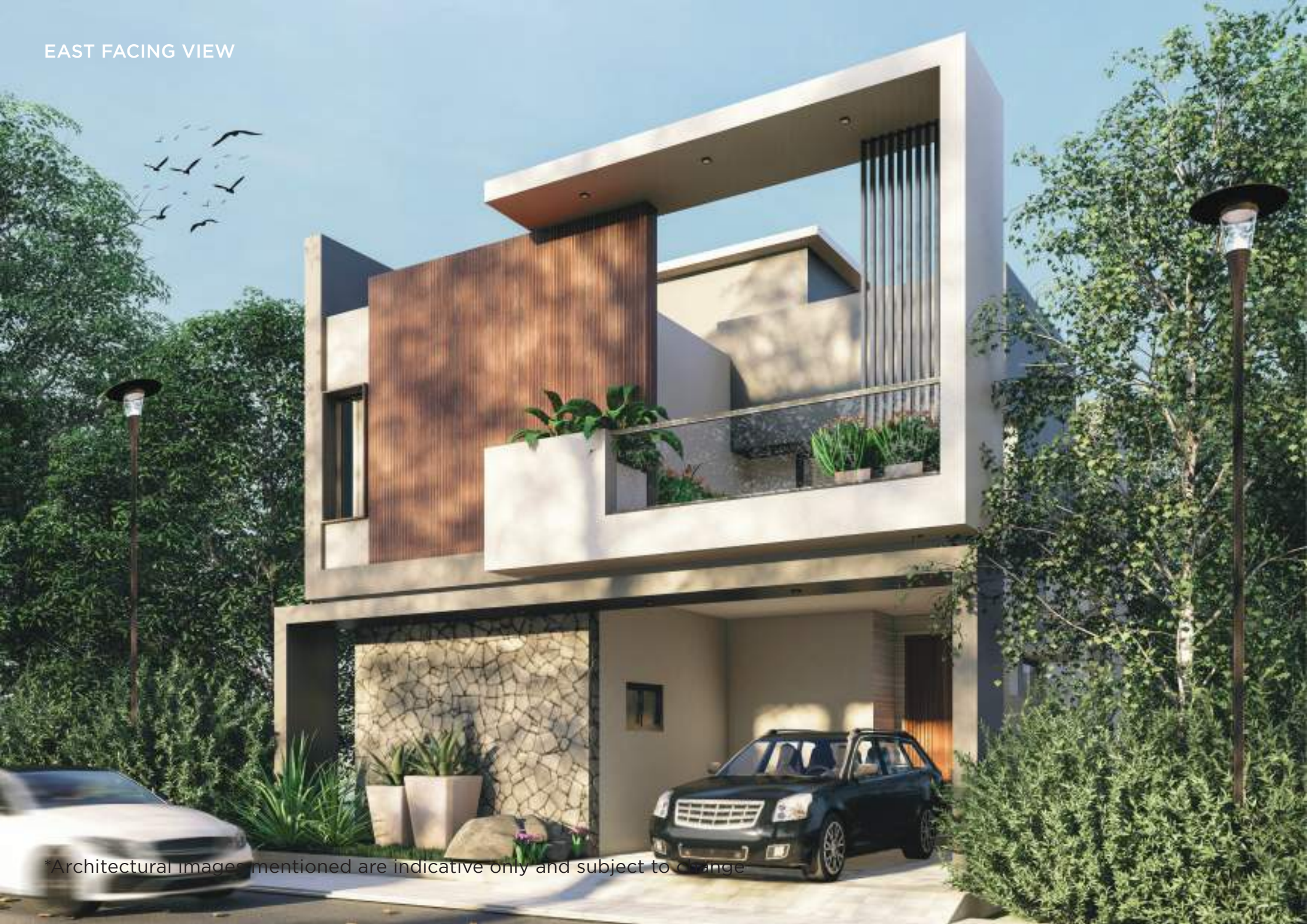
EAST FACING VIEW

*Architectural Images mentioned are indicative only and subject to change