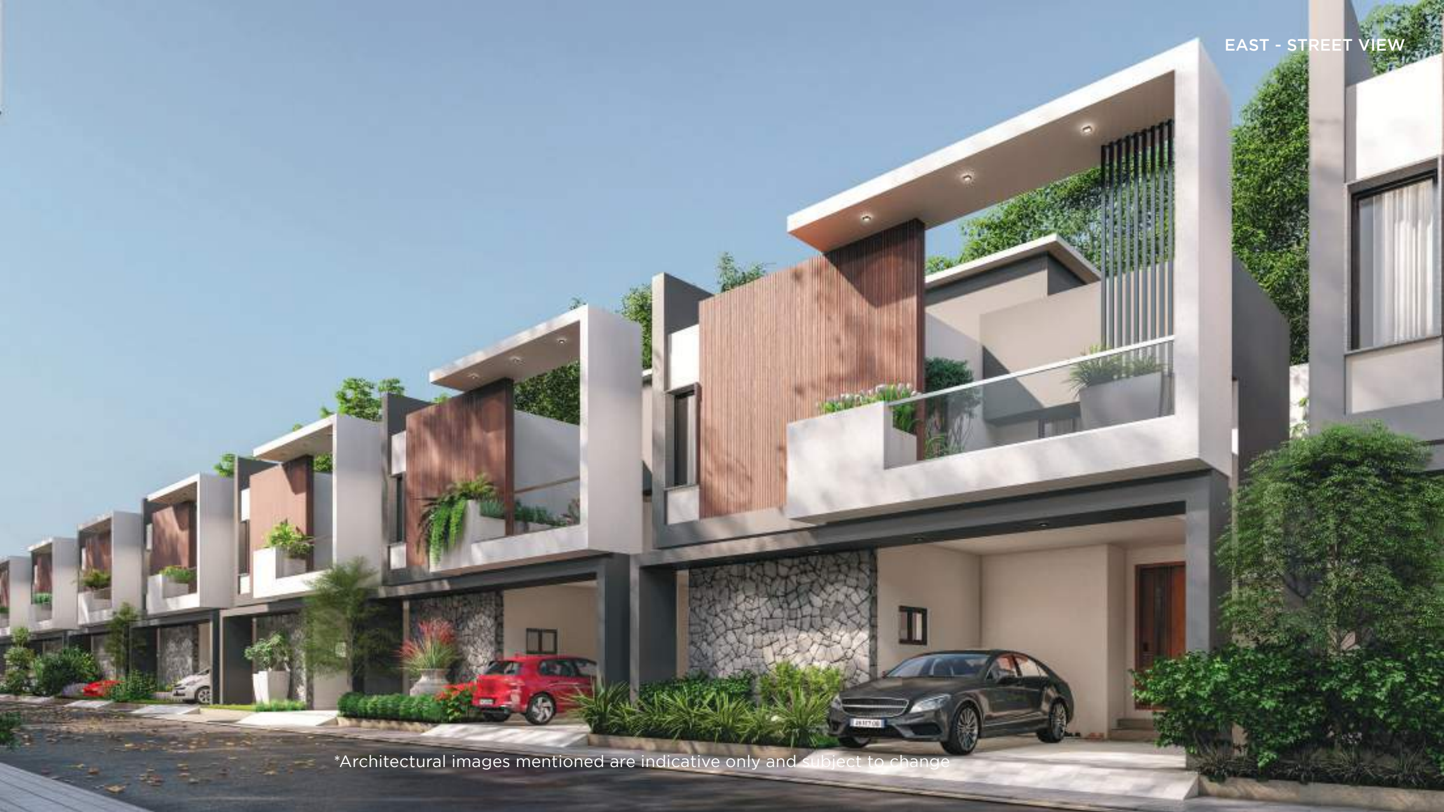
EAST - STREET VIEW

*Note: TAX,Water Connection,Registration at extra cost