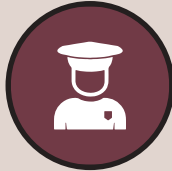
24 x 7 Security