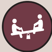
Child play Area